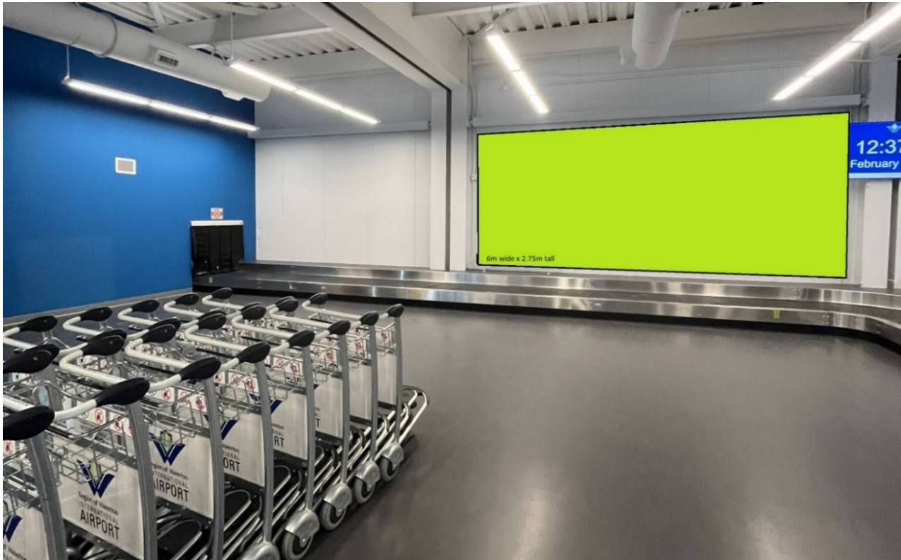
Left wall of Domestic Arrivals Building